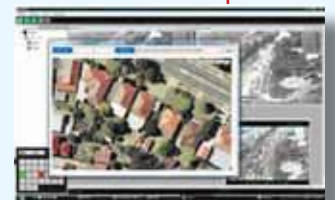
GIS server and other third party system integration (optional extra)